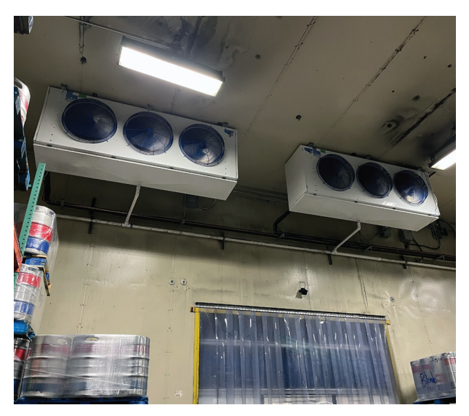
Indoor coils, installed within the keg room cooler