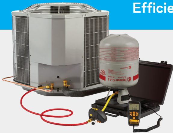
The study below was modeled to show how five (5) consecutive worst-case leak recharges affect system performance using Opteon™ XL41 (R-454B).